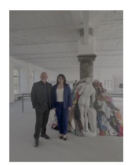
By the Pistoletto Foun

In the last day September 29 the morning was dedicated to a visit of the Biella city center and after lung a final technical meeting was held in order to organize the subsequent visit to Greece in the best way.