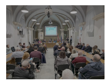
CIVIC Welcome Ceremony